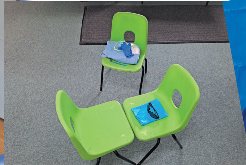
Set up 2 chairs together to be a dental chair and 1 more for the dentist