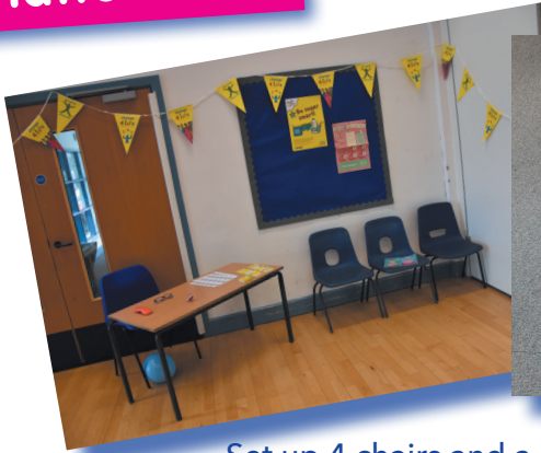
Set up 4 chairs and a table like a waiting room with reception desk